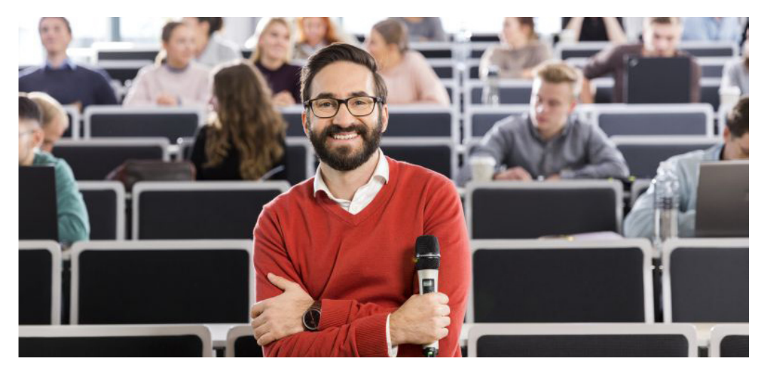
SENNHEISER EDUCATION SOLUTIONS

Effortless microphone management with Sennheiser Control Cockpit